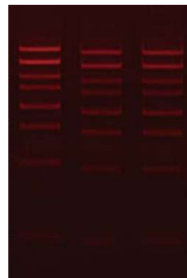
LiGreen™ Red Landing Dye